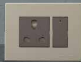
Silver Grey Accessories with Champagne Gold Plate