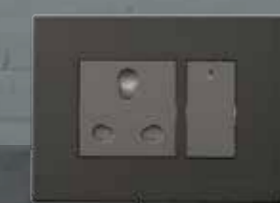
Silver Grey Accessories with Matt Black Plate

Platia by Wipro - a premium flat switch with a thickness of just 7.2mm gives a sleek and aesthetic appeal. Its perfect symmetry and color options integrate seamlessly with contemporary interiors, thus enlivening the ambience.