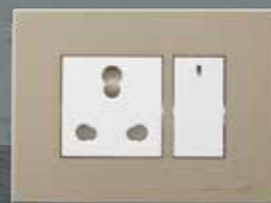
White Accessories with Champagne Gold Plate