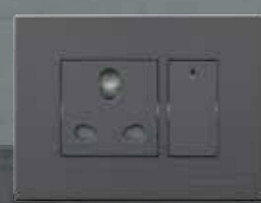
Silver Grey Accessories with Silver Grey Plate