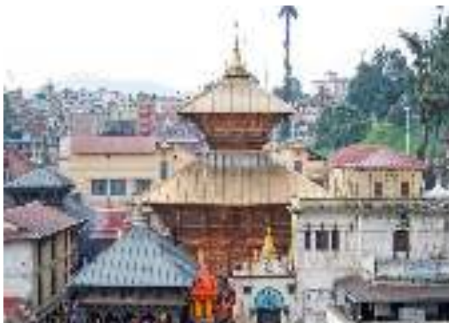
Figure 6: Pashupatinath temple located at the bank of Bagmati river in Kathmandu. The steeple and the metallic roof are seen in the photograph.

This temple is a sacred Hindu temple classified as a UNESCO world heritage site in 1979 that is believed to have been built in 400 BCE. Despite its historical and religious importance, no appropriate protective measures have been taken. It is believed that the metal steeple and the gold-plated metallic roof protect the temple from lightning (Figure 6). In this temple too, there is a trailing metallic strip that runs from the steeple and dangling below the roof.