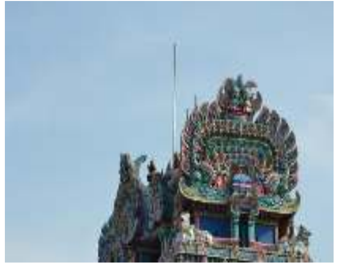
Figure 10: The ESE air termination system installed on the top of the building of Thiruvanaikaval temple.

to the earthing. The Earthing System is a tripod earthing system or G.I pipe, which is completely non-functional in 3 places since down conductors have been cut off in between.