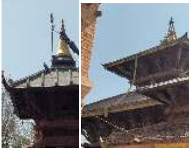
Figure 5: Changu Narayan temple located atop a small hill at Bhaktapur. The photograph on the left depicts an air termination system whereas the photograph on the right depicts the down conductor dangling towards the bottom edge of the roof.

No protective measures against lightning have been taken as it is believed that the gajur (steeple) of the temple itself protects it from lightning. This temple is also a UNESCO world heritage site that is located atop a small hill to the north of Bhaktapur (Figure 5).