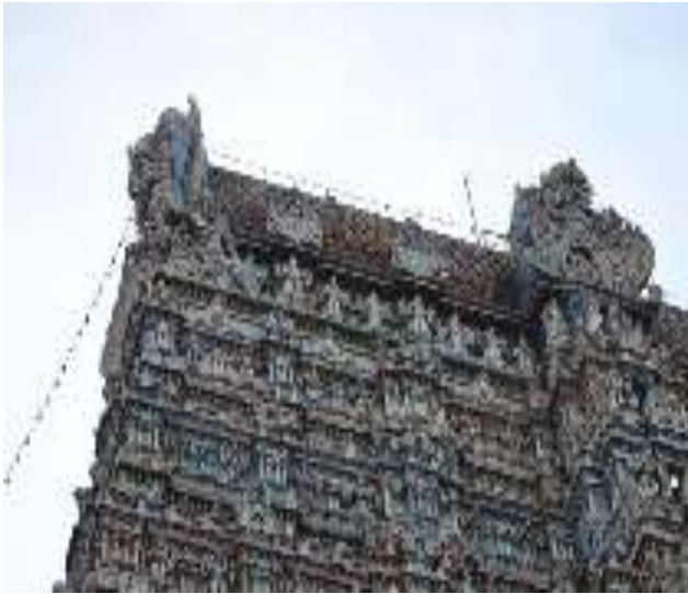
Figure 8: Meenakshi Amman temple located at Madurai Tamilnadu India. An air termination system can be seen on the top of the building.