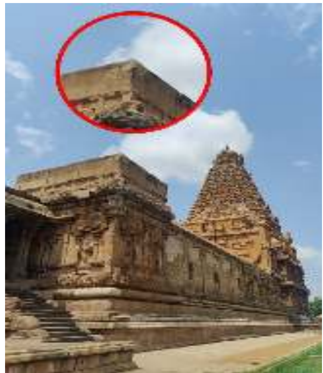
Figure 7: A Photograph of Brihadeeshwara temple located at the bank of the Cauvery river in Tamilnadu India. Shown in the inset is the edge of the temple that was struck by lightning.

Whereas, on the main temple building an air Termination System has been installed which is a conventional type that was clamped to the steeple of the temple. There is a lamp on a stand that was placed higher than the tip of the air termination. Two down conductors are taken almost together (at a few centimetre separation). A large number of acute bends on the down conductors can be observed. The copper strip has directly been brought into the ground and no earth pits were observed.