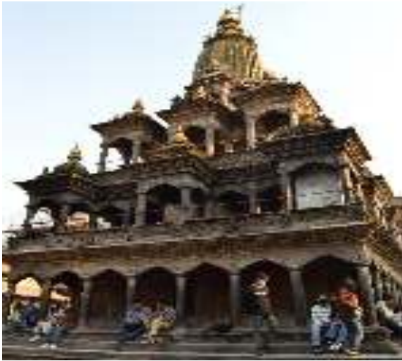
Figure 1: Krishna Mandir (Lord Krishna's temple) built on the premise of Patan Durbar square that has an air termination steeple on the top that is not connected to a down conductor system or an earth termination (to be witnessed).

LPS, but some do have down conductor-style metallic strips hanging atop the structure (Figure 1).