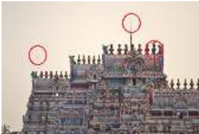
Figure 12: Three ESE air termination systems installed on the top of the buildings at Srirangam temple.

Each of the 12 air terminals had a single down conductor each running directly into the earth without proper pits or earth termination system.