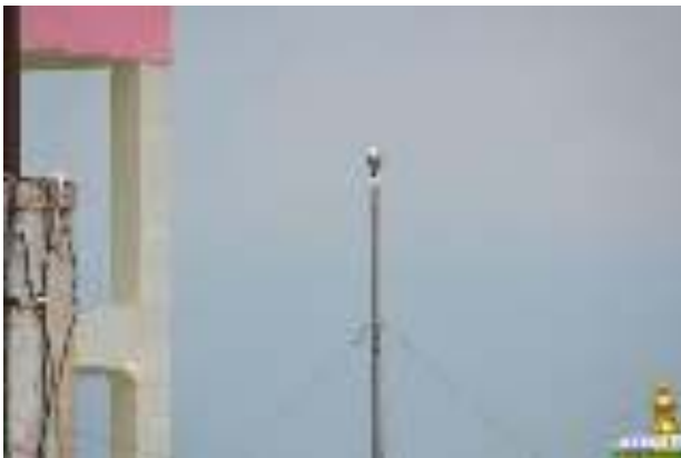
Figure 9: A Photograph of the ESE air termination system installed close to the entrance gate and well below the top of the structures in the close vicinity.

An ESE type air terminal was also present close to the entry point of the temple which is at the height of the foot of the temple, with one down conductor touching the ground.