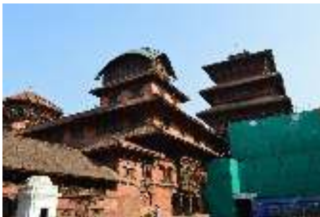
Figure 2: Basantapur tower that is being recently rebuilt after it was demolished by the 2015 massive earthquake. It can be seen on the tower that a single lightning air termination system followed by a single down

The Basantapur Durbar area is also a constituency of multiple archaeological structures, among which the famous Shiva Parvati temple and Hanuman Dhoka are also present. None of the Structures Present in the Durbar Square Premise has any form of LPS, but some do have a down conductor style metallic plate hanging atop the structure, except for one of the structures in the Patan durbar square. However, a lightning arrester followed by a single down conductor can be seen on Basantpur tower- a nine-storied structure that is being reconstructed after it was destroyed by the massive 2015 earthquake (Figure 2). Although a multinational company has been rebuilding the tower, none of the workers could explain the LPM being adopted. The Basantapur Durbar Square is located at the heart of Kathmandu, where there are dozens of archaeological structures but none of them seems to have proper LPM installed.