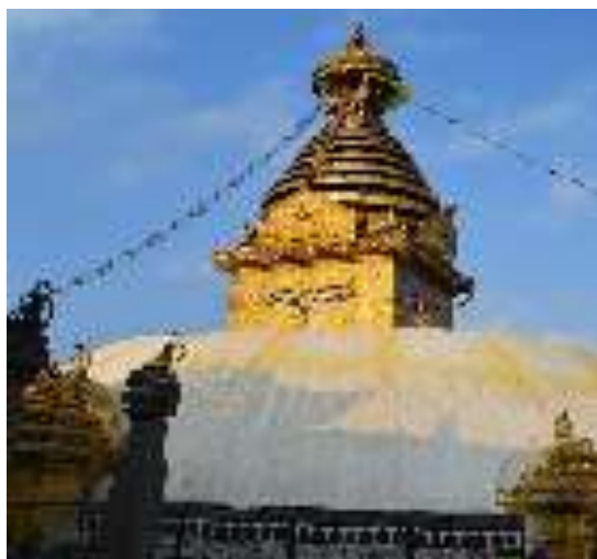
Figure 5: A photograph of Buddhist temple (stupa) at Swayambhunath, built atop a small rocky hill (around 640 AD) in the western part of Kathmandu Valley.

Similarly, the Buddhist temples/stupas built during the medieval period have large mettalic structrues towards the top of the structures.