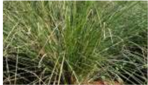
Figure 2: A snapshot of reed-grass which is believed to (and advocated by the Hindu priests) avert lightning from striking the house.

b) Many hindus in Nepal and India keep the reed-grass or big cordgrass ( Desmostachya bipinnata ) in their house with the belief that this grass protects the house from lightning and fire.