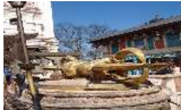
Figure 3: A photograph of Vajra (Dorje) placed on a pillar in front of a Swayambhunath Buddhist temple in Kathmandu Nepal. Note that the temple, partly seen next to the Vajra, was struck by lightning on 13 th February, 2011.

c) Vajra (dorje) is placed on pillars in front of Buddhist temples with a belief that the thunderbolt is buried underneath and hence no lightning will strike the temple.