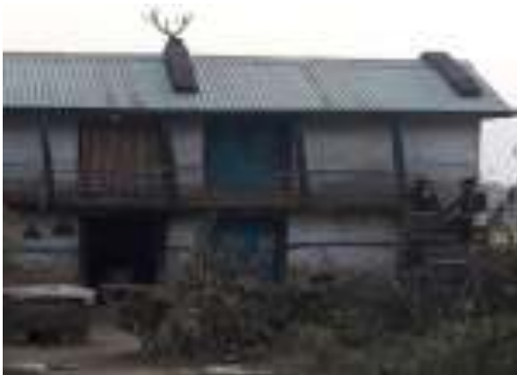
Figure 1: A photograph of cactus plant placed on the roof of common house in Nepal for averting lightning from striking the house.

a) Cactus trees are planted on the roof of a house during the house warming ceremony that is believed to protect the house.