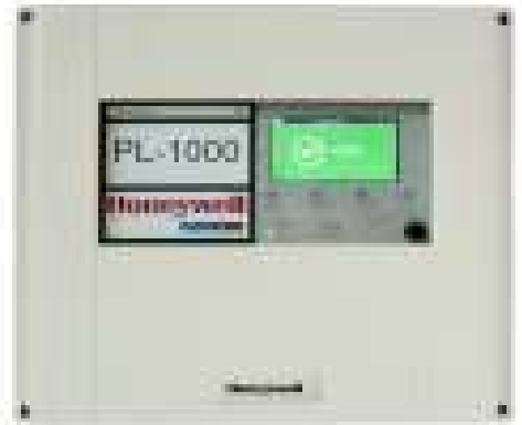
Morley-IAS Plus PL-1000