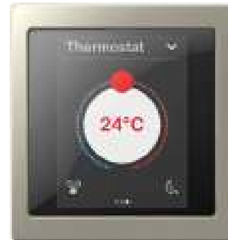
KNX Multitouch Pro System Design, D-Life Metal, nickel metallic