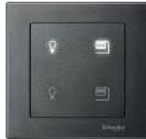
KNX Pushbutton Pro System M, M-Pure, anthracite