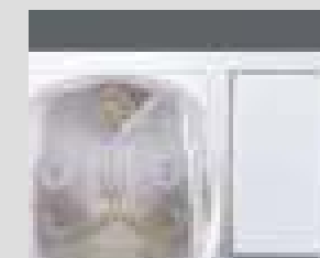
Wide ribs for hassle-free, non-obstructive switch and plug top operation