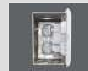
Slim socket back leaves more space for wire movement and reduces pressure on module