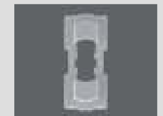
Spark shield to arrest the spark within the switch, safeguarding the user