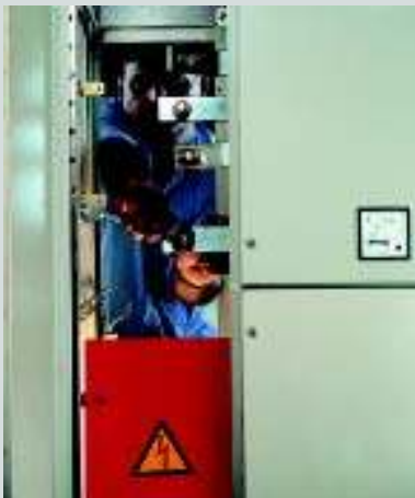
Wide 250mm Cable alley makes cable termination easy.