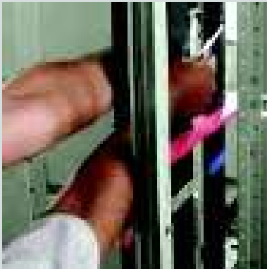
Access to the last vertical busbar available from both sides.