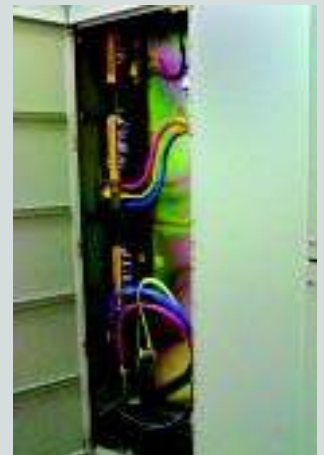
Unique design with rear cable access