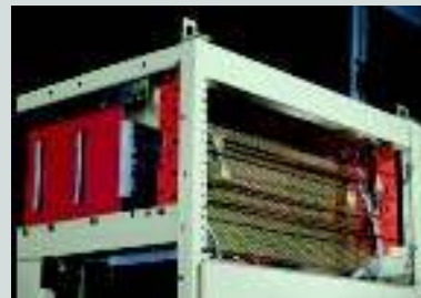
Main busbars and control busbars are totally segregated from each other. Upto 11 number control bus per panel.