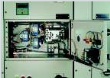
Module width of 500 mm facilitates safe & easy equipment replacement.