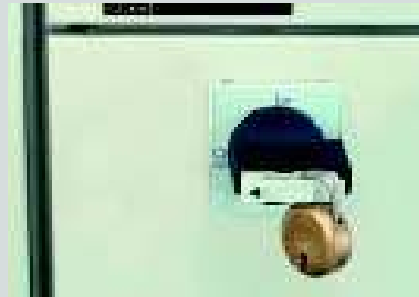
Door interlocks & padlocking facility.